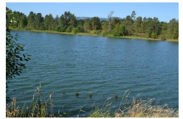
(2) Horseshoe Lake