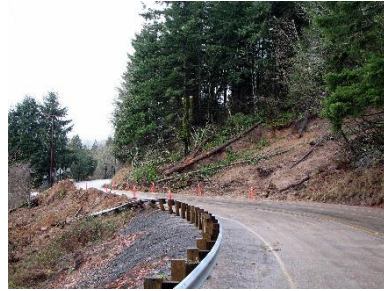
(4) Carrolls Road Landslide