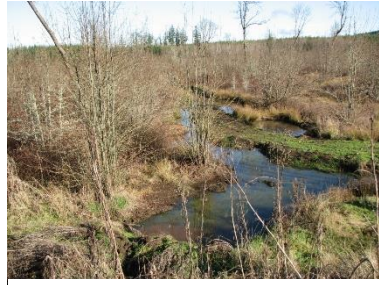
(1) Toutle Wetlands

Critical Areas include (1) wetlands, (2) fish and wildlife habitat conservation areas, (3) frequently flooded areas, (4) geologically hazardous areas, and (5) critical aquifer recharge areas.