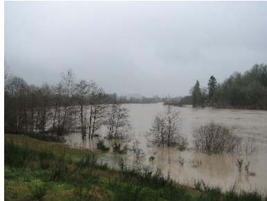
(3) Cowlitz River