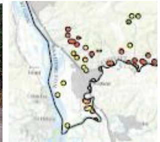
(5) Wellhead Protection Areas